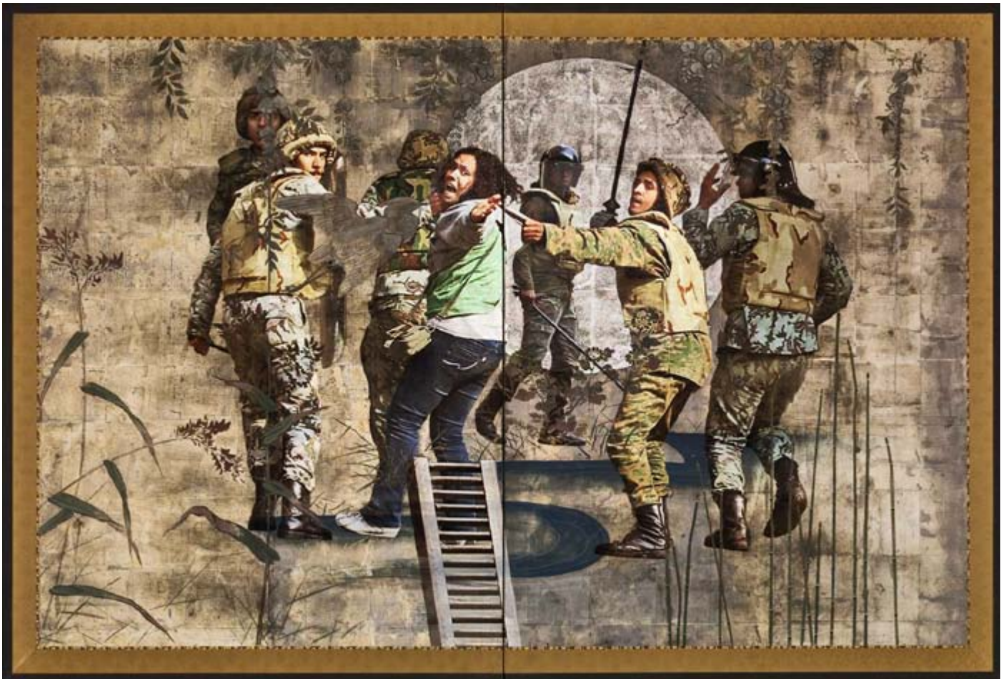
A woman is taken away by the Egyptian army during clashes in central Cairo on Dec. 16, 2011. (Khaled Elfiqi)