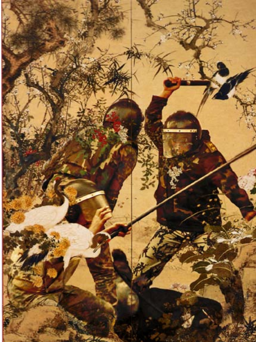
Egyptian army soldiers beat a protester wearing a Niqab, an Islamic veil, during clashes near Cairo's downtown Tahrir Square, Egypt, Friday, Dec. 16, 2011. Activists say the clashes began after soldiers severely beat a young man who was part of a sit-in outside the Cabinet building. At background graffiti depicts members of the military ruling council and Arabic reads: "Killer".