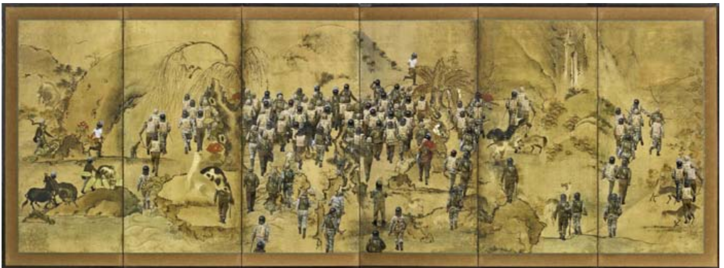
Egyptian army soldiers run during clashes with protesters at Tahrir Square in Cairo December 17, 2011. Soldiers beat demonstrators with batons in Cairo's Tahrir Square on Saturday in a second day of clashes that have killed nine people and wounded more than 300, marring the first free election most Egyptians can remember.